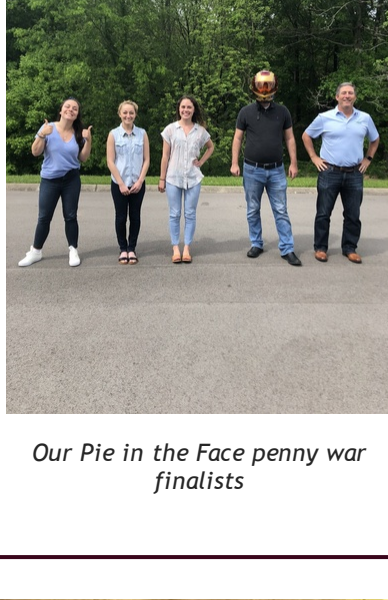
Our Pie in the Face penny war finalists